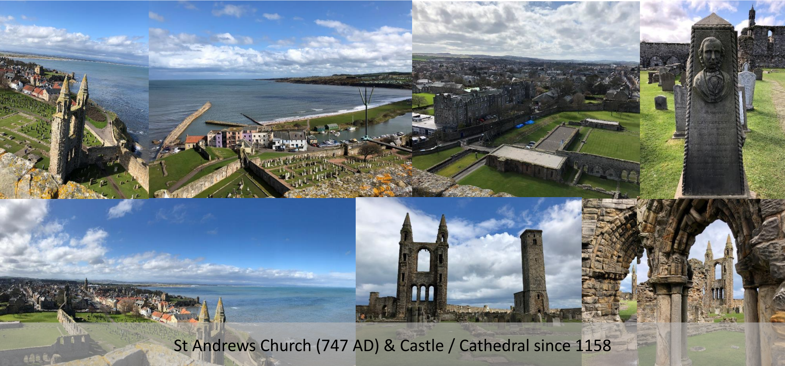
St Andrews Church (747 AD) & Castle / Cathedral since 1158