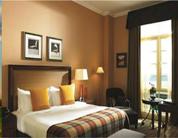
Fairmont Hotel, St Andrews