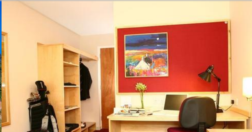
David Russell Apartments, St Andrews