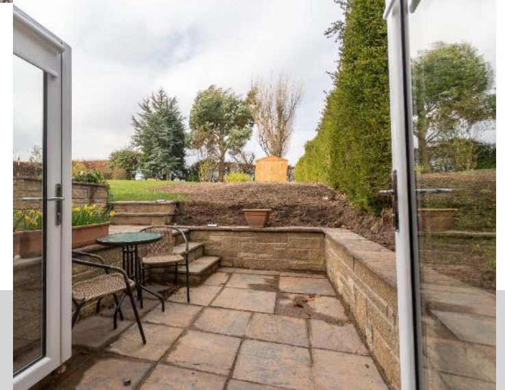
West Acres, St Andrews