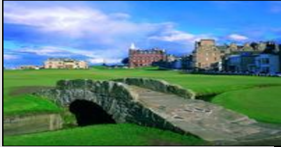
Old Course , St Andrews