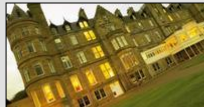
Marine, North Berwick