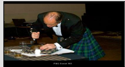
Scottish Dinner, New Club