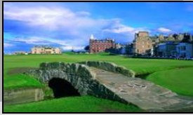
Old Course, St Andrews

在几乎任何一份世界球场排名中，老球场都会在前10之列。它是如此特别的林克斯球场，因为它是大自然母亲的作品。有关它的描述已经太多：世界上最有名的林克斯球场，高尔夫的圣地。它也是实际上最古老的高尔夫球场。