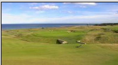
Kingsbarns Golf Links