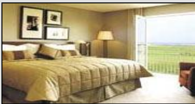
Old Course Hotel