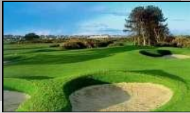
Carnoustie Links, Angus

卡洛斯特球场，地处苏格兰东部海滨的卡洛斯特镇。和著名的圣安德鲁斯老球场一样，是英国七大经典滨海球场之一。其中卡诺斯特冠军球场与周围很多滨海球场不一样，它的每一洞都是围绕中间的陆地向四周延伸开来，并依水而建，且没有连续的球洞是与风向一致或是顺随雨势。