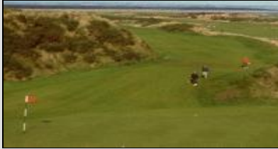
New Course , St Andrews