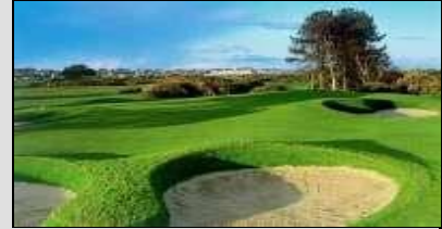
Carnoustie Links, Angus