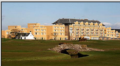
Old Course Hotel