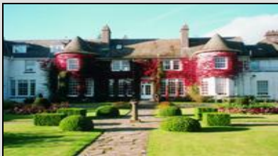
Rufflets Country House Hotel