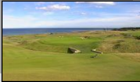
Kingsbarns Links, St Andrews